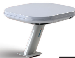
EXAMPLE OF THE PEREGRINE u8 INSTALLED ON AN OFF-THE-SHELF PEDESTAL